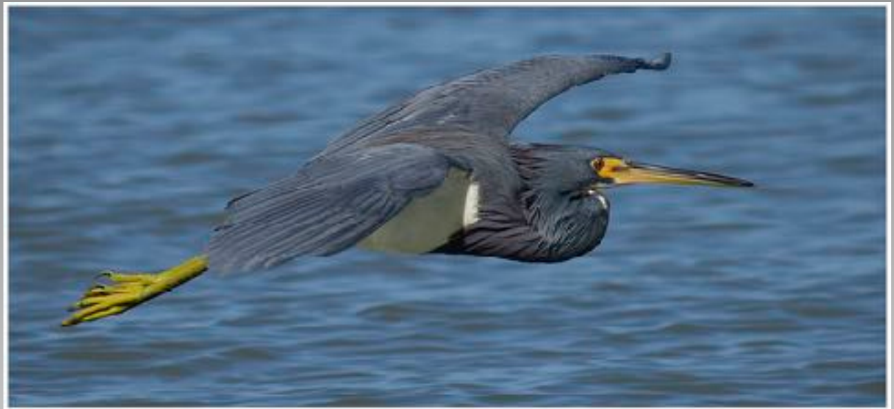
Tricolored Heron