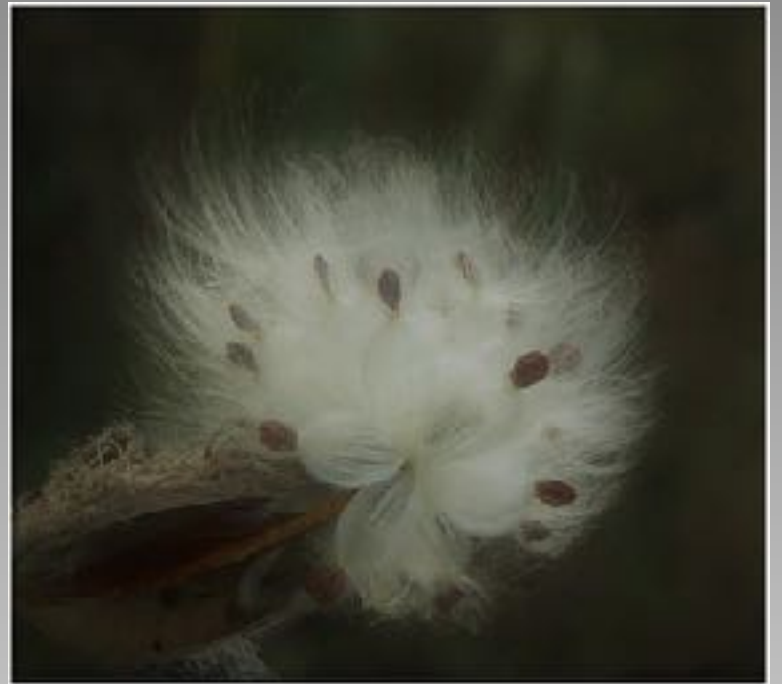
Milkweed