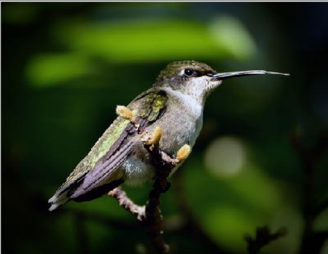
Taking a Rest