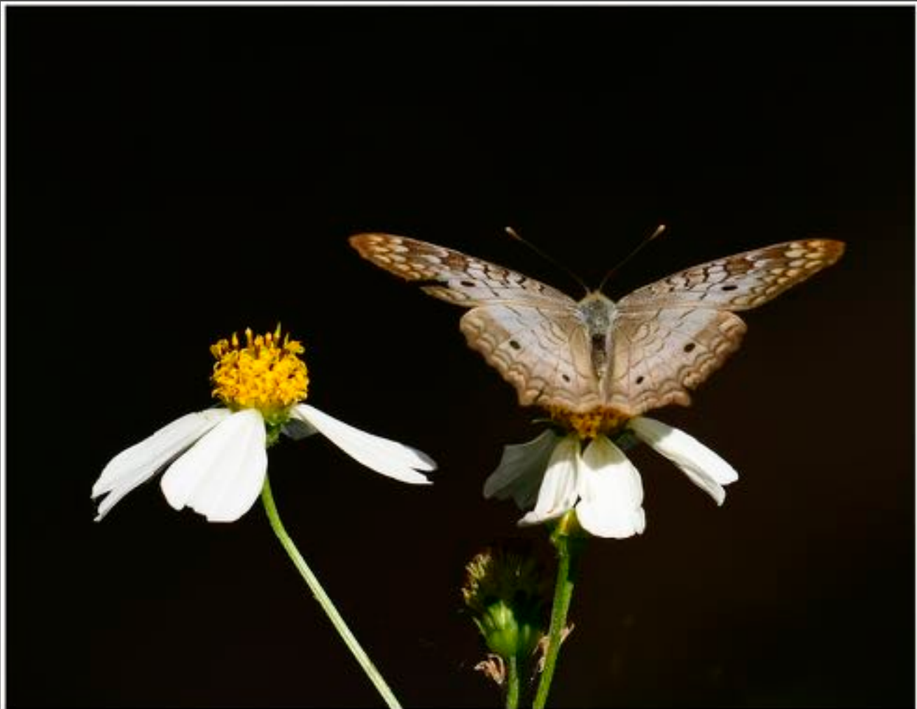
White Peacock Butterfly