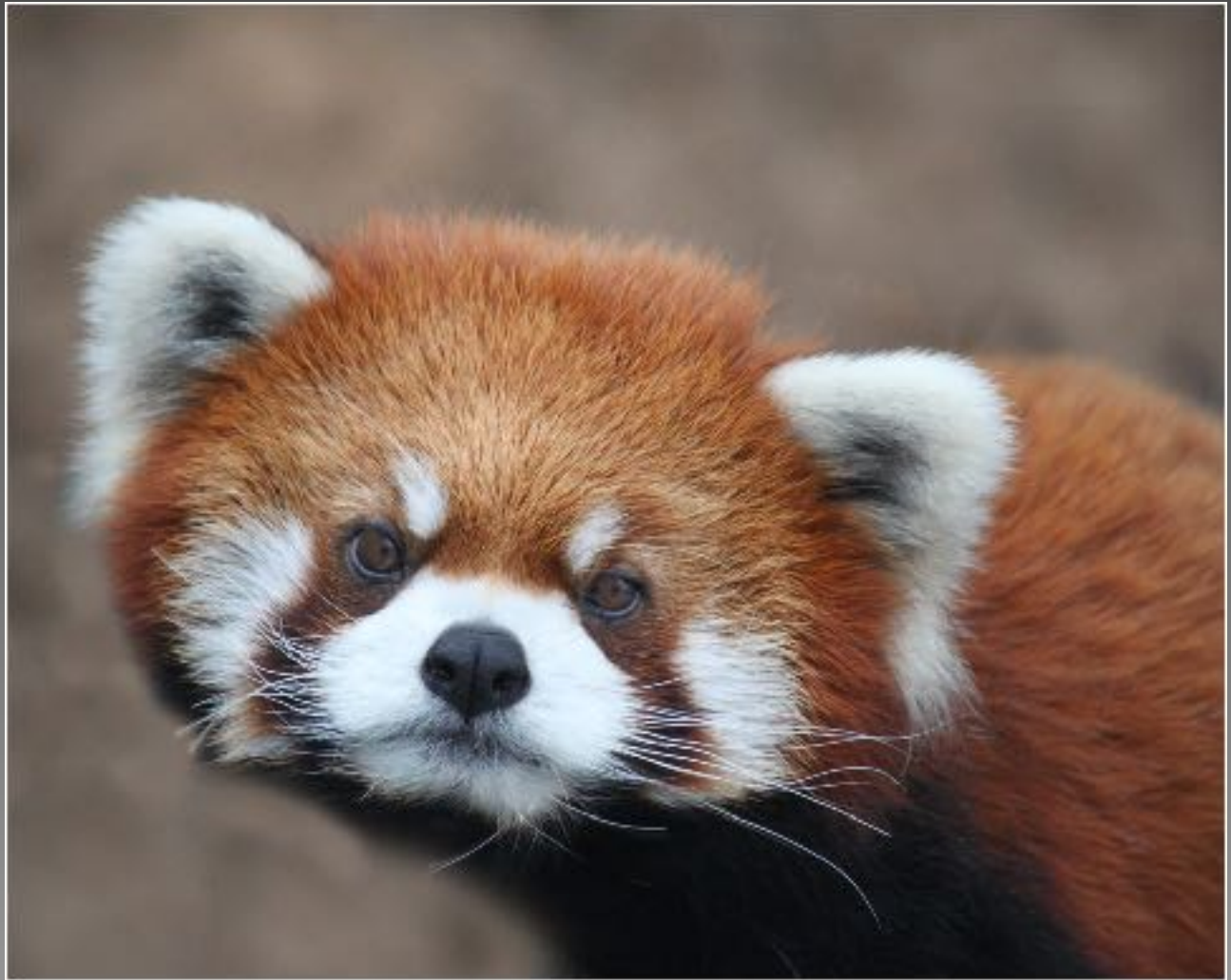
Red Panda