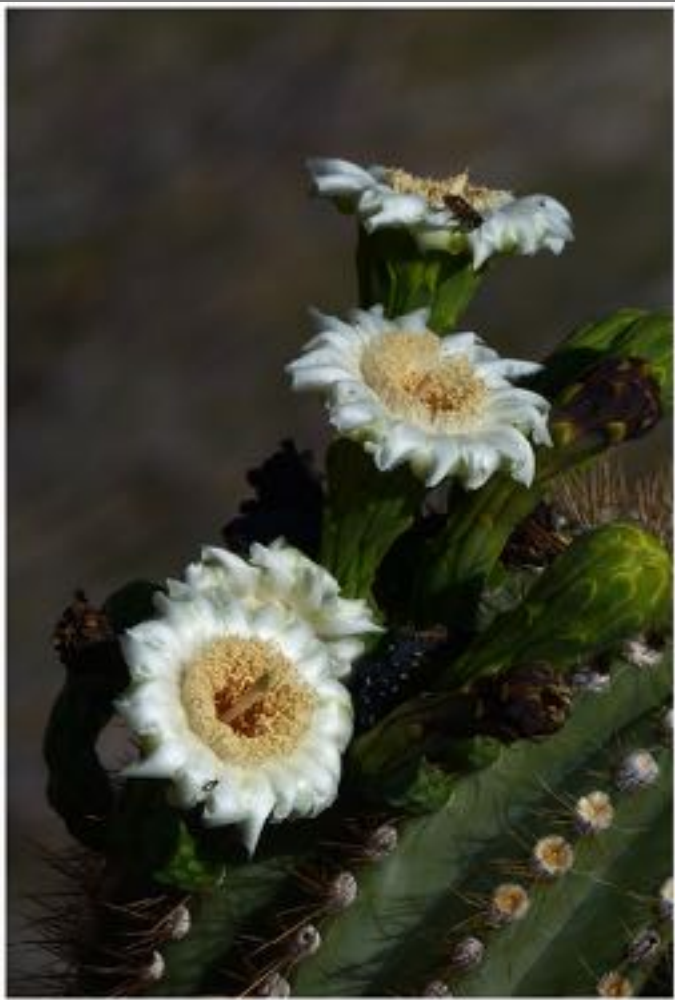
Look But Don't Touch , ©Marie Caviness