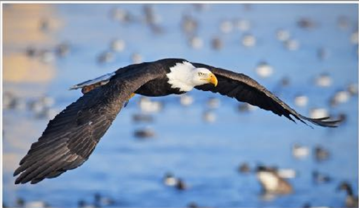
December Eagle