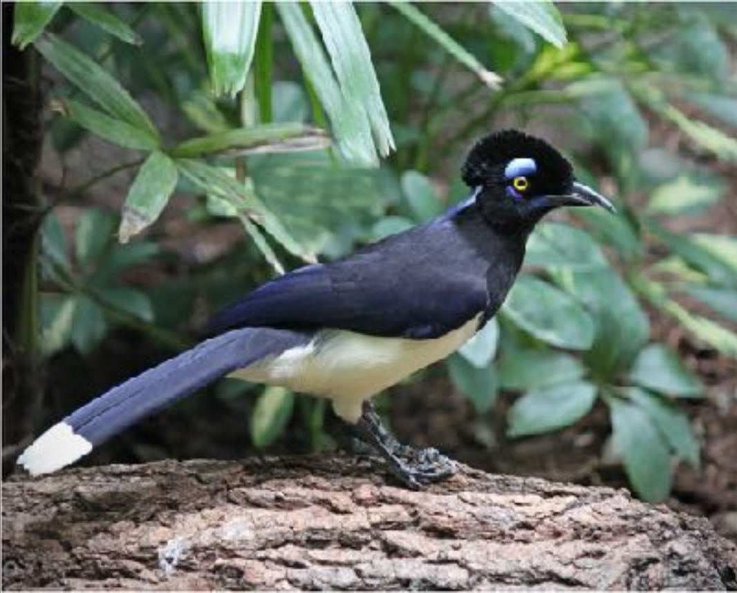
Plush Crested Jay , ©Jenny Kalter