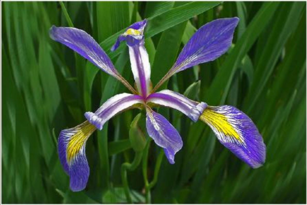
Dwarf Lake Iris , ©Marie Caviness