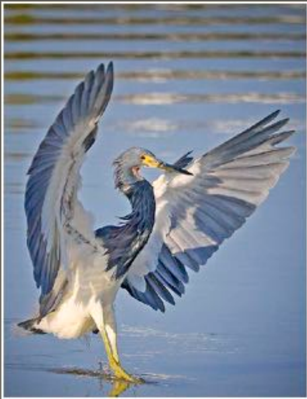
Tricolored Heron