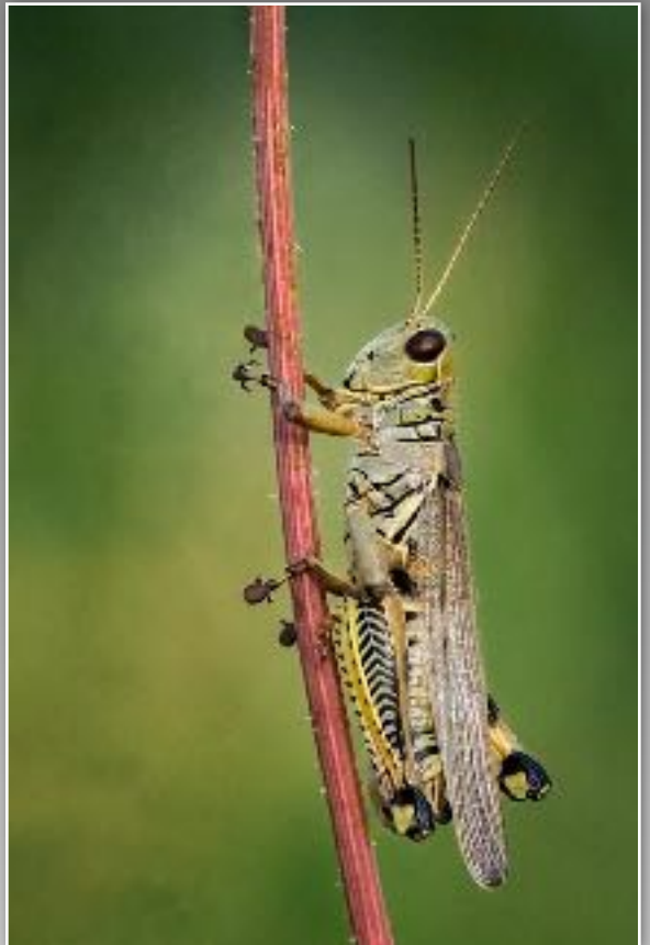
Grasshopper , ©Norma Mastrogiuseppe