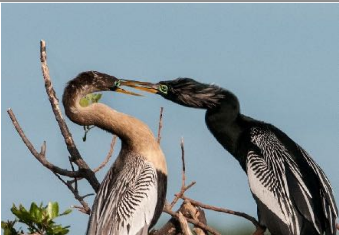
Back Off