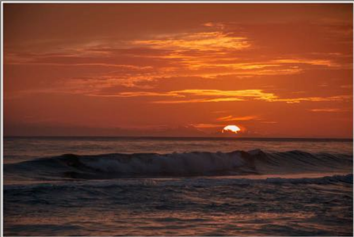
Panhandle Sunset , ©Gary Edwards