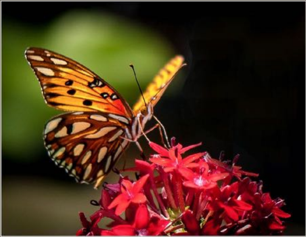
High Lighted