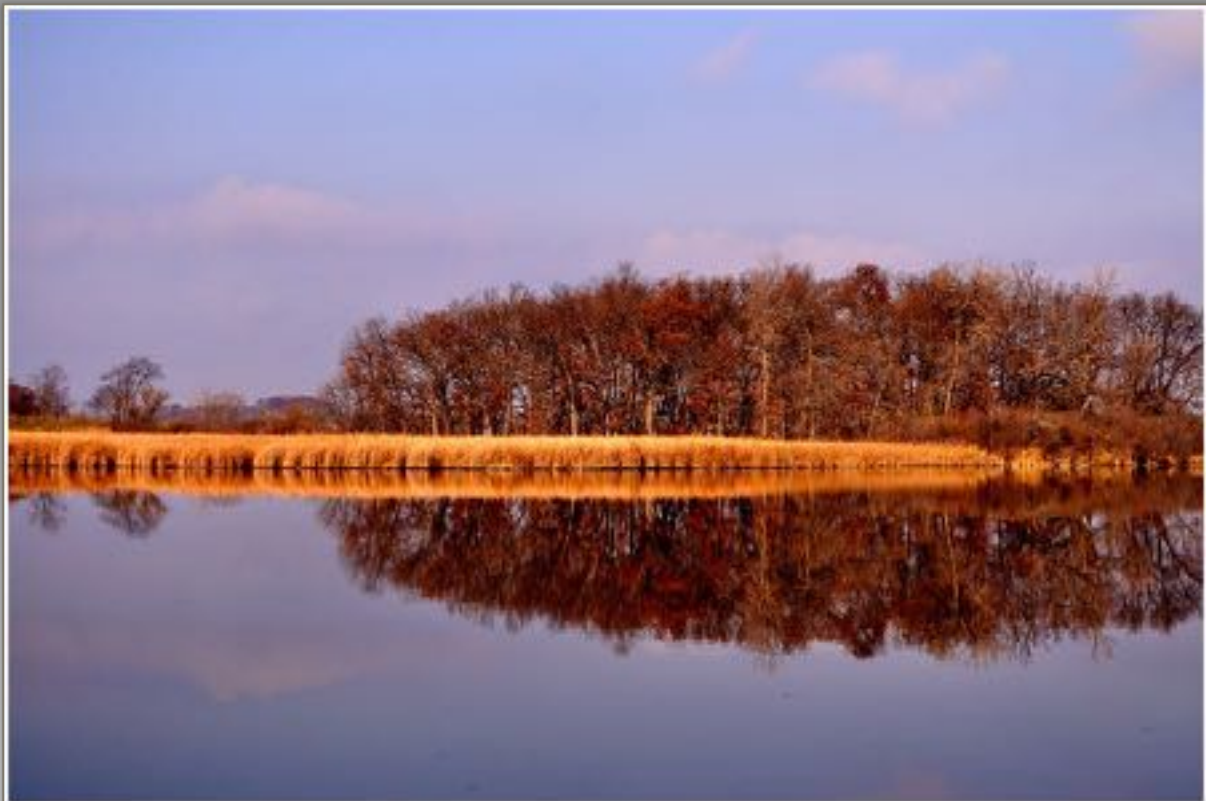
Fall Tranquility