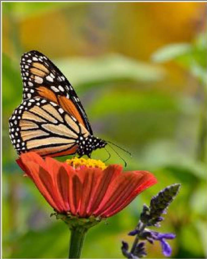
Monarch on Zinnia