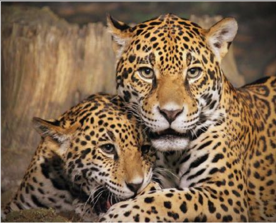
Hanging with Mom