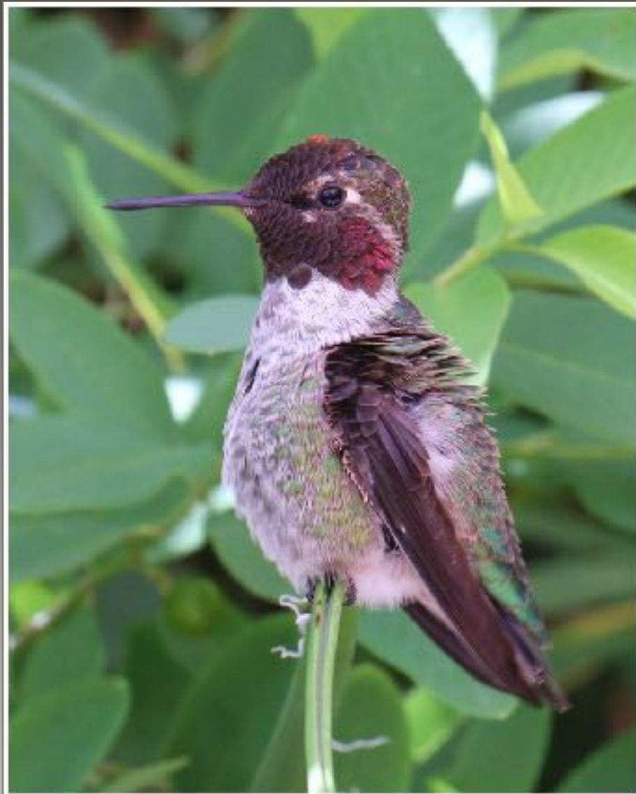
A Moment's Rest, ©Tammy Rusch